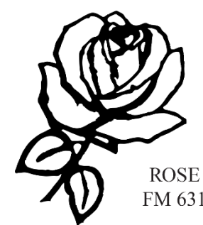
ROSE FM 631