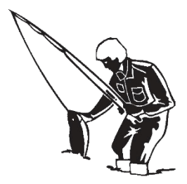
FISHERMAN WADING FM 537