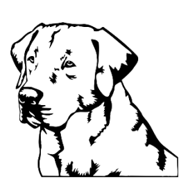
LABRADOR FM 4451