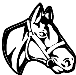
HORSE'S HEAD FM 569