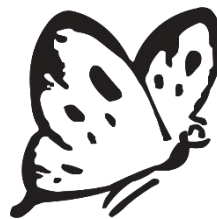
BUTTERFLY FM 405