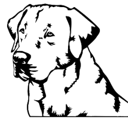
LABRADOR FM 4451