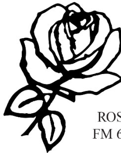
ROSE FM 631