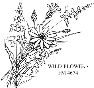
WILD FLOWERS FM 4674