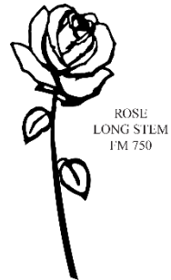
ROSE LONG STEM FM 750