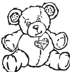
TEDDY FM 4782