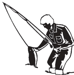
FISHERMAN WADING FM 537