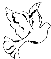
DOVE OF PEACE FM 358