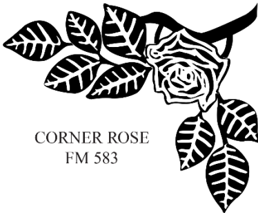
CORNER ROSE FM 583