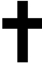
LATIN CROSS - PLAIN SOLID FM 1